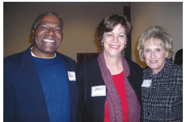
LFC, MS and MCPN were recently recognized for their commitment to client advocacy by the Colorado Consumer Health Initiative.

medical bills, medical equipment and a host of other needs. And, you appreciate the difference that comes from reading this newsletter and